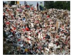
Domestic Waste (tonne)